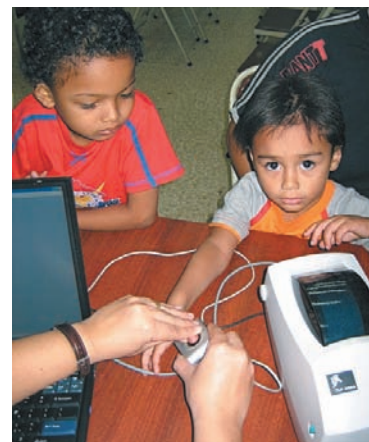
Utilizing health informatics tools