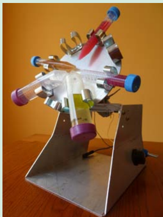
A rotator built by Tekla Labs