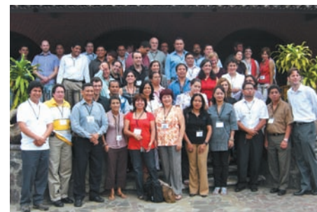
IMeCA meeting, Nicaragua, Nov/Dec 2010

In an exciting development, SSI recently became the project implementer for a public-private partnership alliance with Ericsson (communications equipment), Claro (mobile provider), and the 4th Sector Health project (ABT Associates, USAID funding) that will for the next two years investigate the potential for mHealth applications to improve maternal and child health in Nicaragua. SSI will work closely with the Nicaraguan Ministry of Health as well as Catholic Relief Services-Nicaragua to implement various kinds of ICT for Health tools to support improved information management of high-risk pregnancies and hopefully help to increase access to key maternal and child health services.